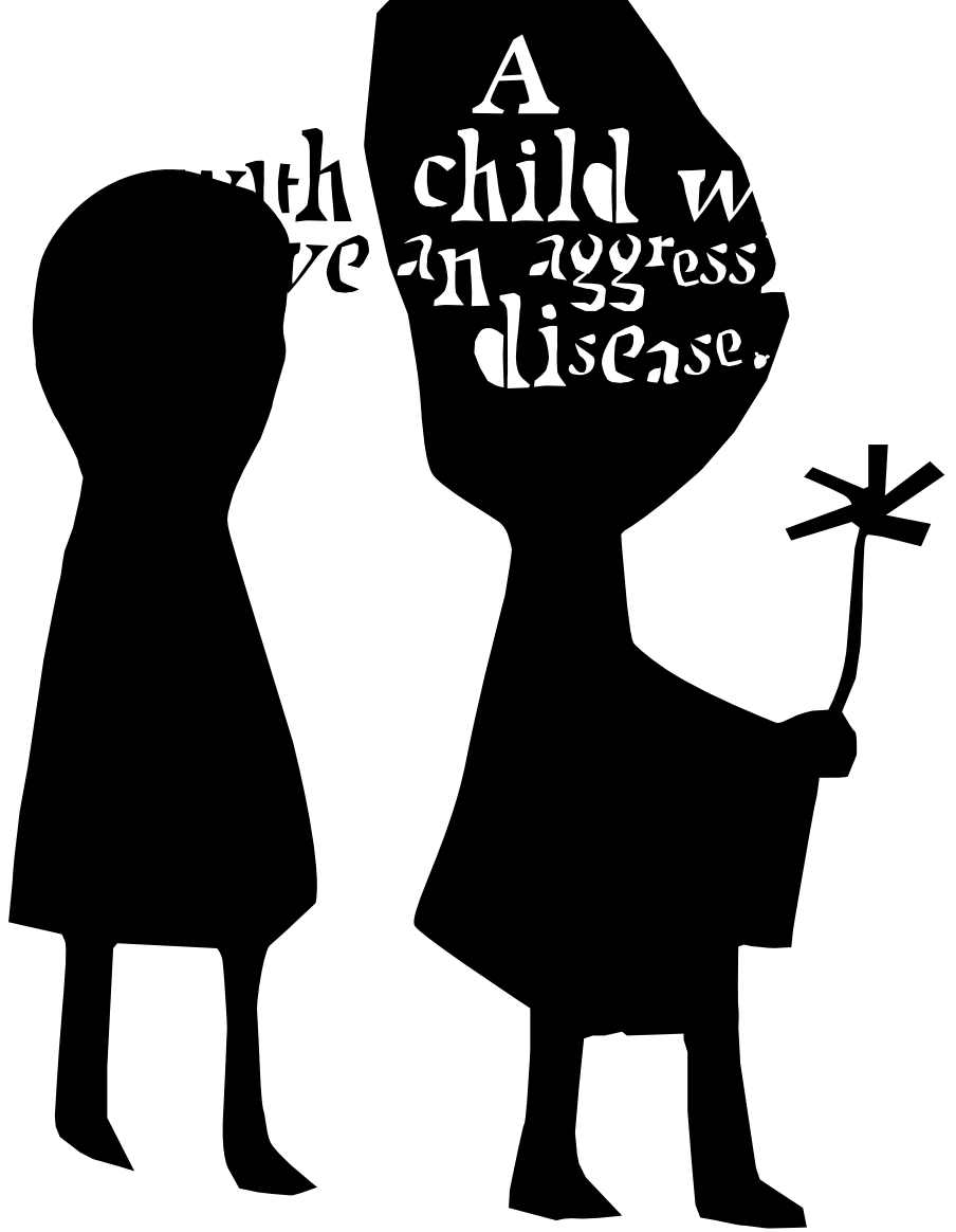
Typeface and text by Eduardo Berliner