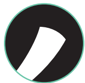
terminal of the hat